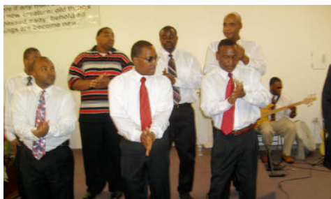
(left) Men's Day August 16, 2009