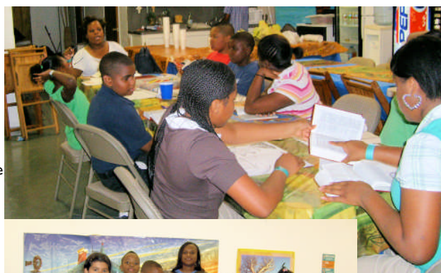
(right) Vacation Bible School, August 12-14, 2009 See website for more