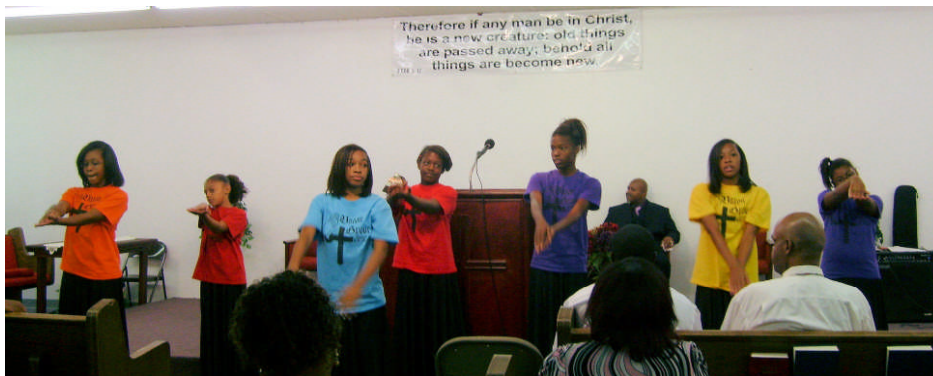
Union Grove Baptist Church’s Youth Praise Team performs at Men’s Day Program August 16, 2009